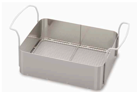
Baskets made of stainless steel