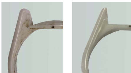
Removal of polishing pastes