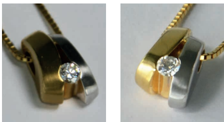
Removal of polishing pastes