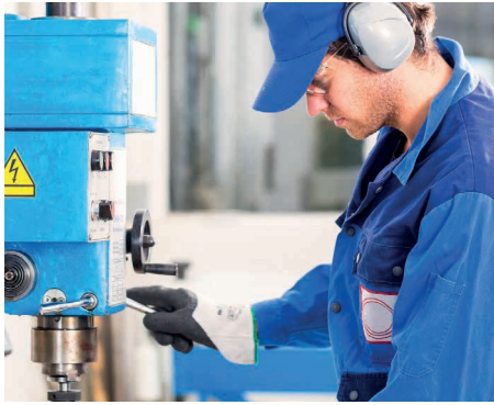
Industrial parts cleaning of motor parts, filters, etc.

Robust tabletop ultrasonic devices for heavy-duty applications