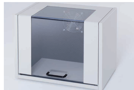
Noise protection box