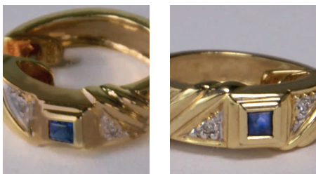
Removal of wear dirt