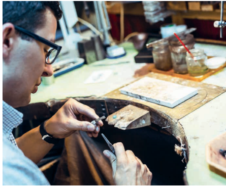
Cleaning of rings, necklaces, earrings, etc.