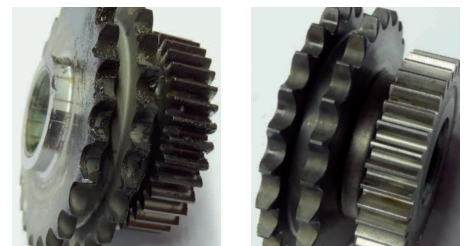
Removal of grease and silicone