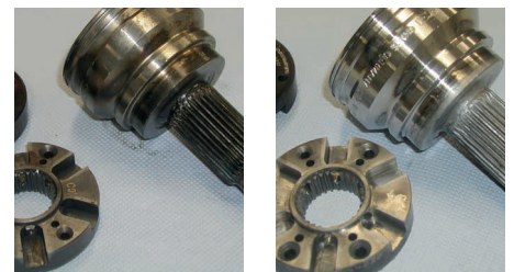
Removal of oxidation and other contaminants