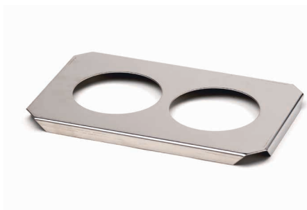
Perforated cover for using beakers